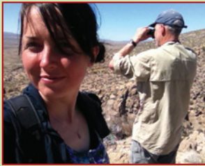
In Big Bend