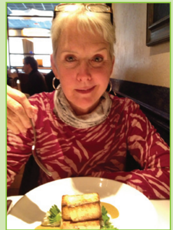
Eating at a Rick Bayless restaurant