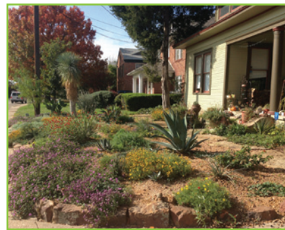
His yard in November