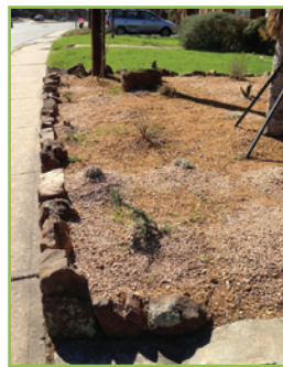
Burton's yard in March

In September, the Observer awarded it the Best Xeriscaped Yard of 2013.